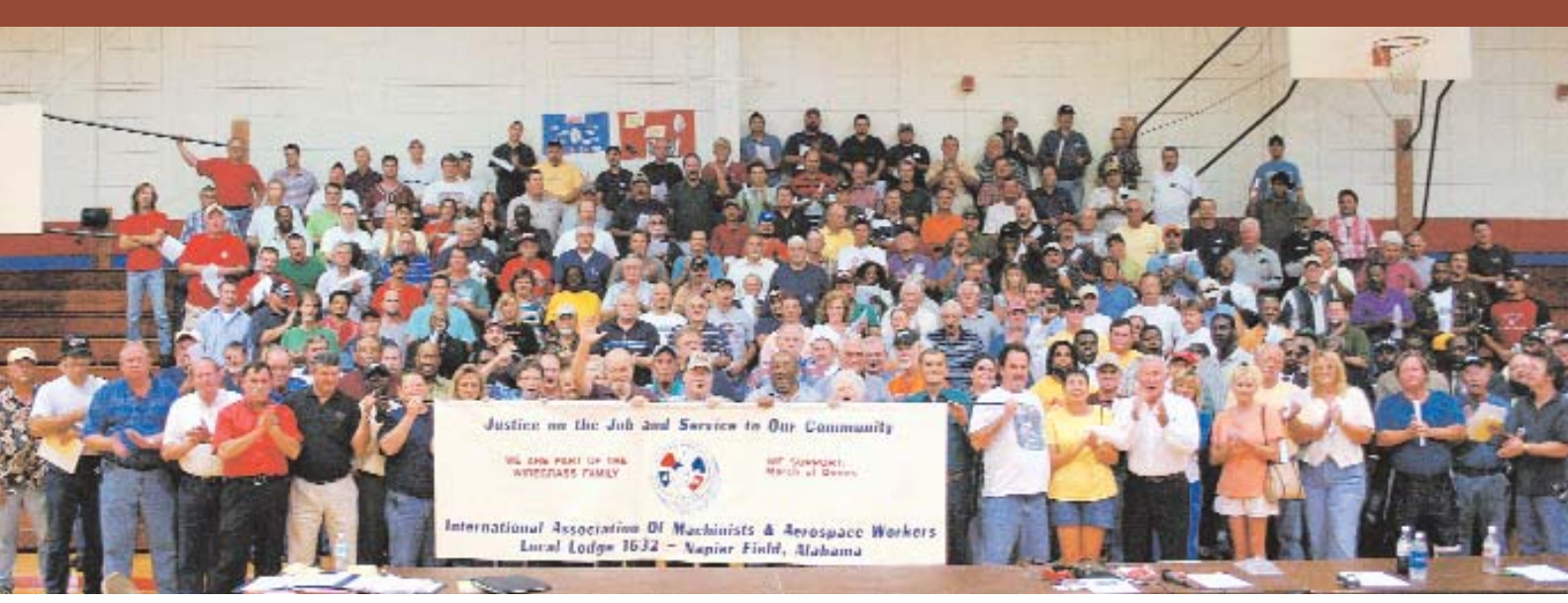
Nearly 200 IAM Local 1632 members in Dothan, AL triumphed after a 59-day lockout by Pemco World Air Services. Extraordinary solidarity and strong community support forced Pemco to end the lockout and offer a much-improved contract.